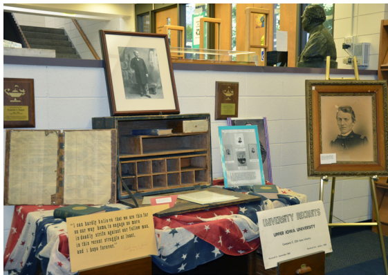
Company C display in Henderson-Wilder Library

UIU Oral History Project – Alumni and other guests are invited to participate in the oral history project during a visit to the University Archives. Alumni may record their own story to become part of the collection; or they can view other alumni's stories recorded on videotape and available in the listening booth.