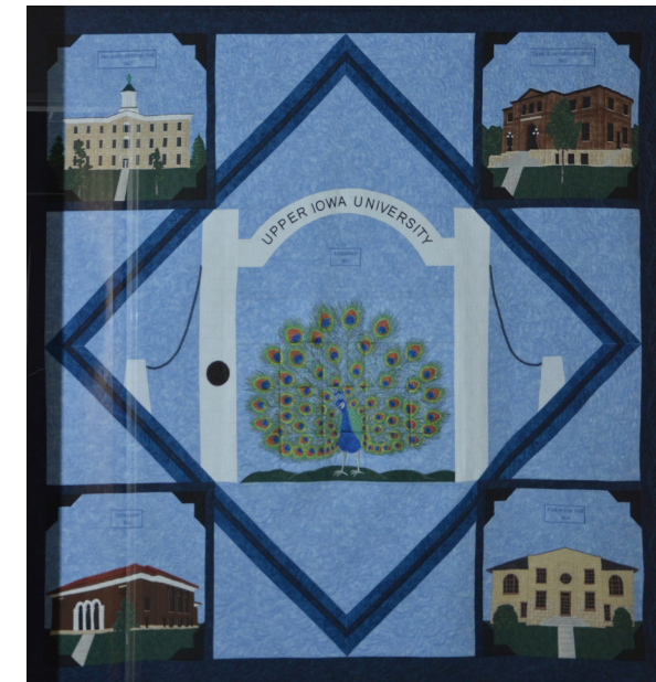
Handcrafted Quilt displayed in the Student Center